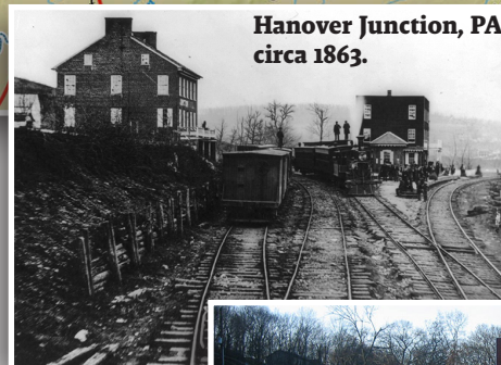
Hanover Junction, PA circa 1863.