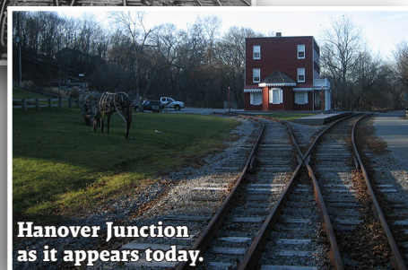
Hanover Junction as it appears today.